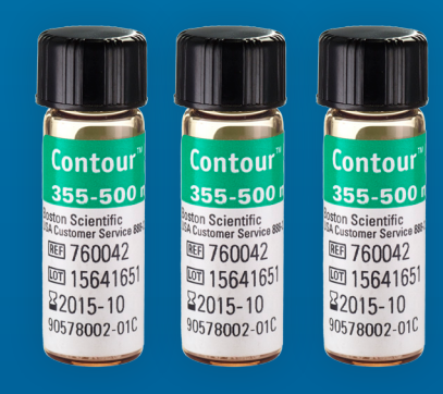
3 mL – Contour PVA Particles

Contour PVA Particles occluded the uterine artery with 67% less product and equivalent clinical results as compared to Merit Medical Embosphere Microspheres.<sup>1</sup>