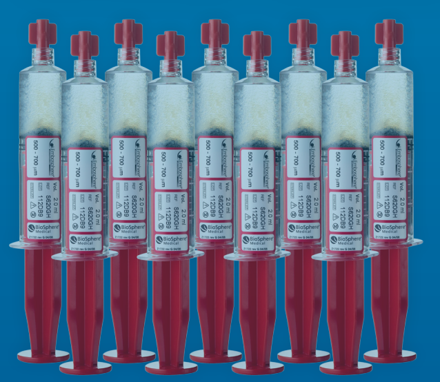
9 mL – Merit Medical Embosphere Microspheres

Contour PVA Particles occluded the uterine artery with 67% less product and equivalent clinical results as compared to Merit Medical Embosphere Microspheres.<sup>1</sup>