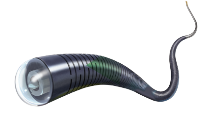
Contour™ Embolization Particles